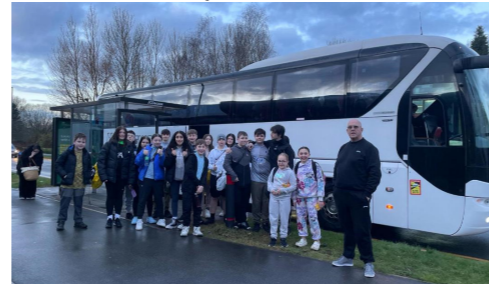
Southport Sea Cadets

These sessions included cookery and budgeting classes, plus the extended signposting and eventual casework, will work with the individual client to get them on the road to financial independence.