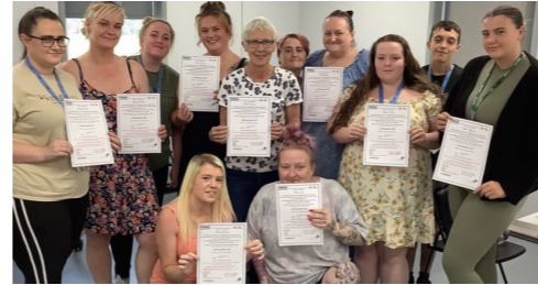
Oasis Community Hub

Sessions that took place at the Community hub were Toddler Tots Stay and Play, Cook and Eat, Confidence building, First aid courses and Job Clubs and CV classes. Without this funding all the above classes and other activities would not have been possible. The sessions have been invaluable around Broadoak/Smallshaw area in Ashton.