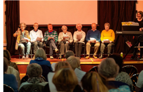
My Voice, My Place.