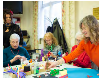
City Arts 'Blue to Green' Project:

The project provided opportunities for 12 clients to volunteer with them, 5 of whom have stayed on for over 6 months. This has had a marked increase on their self-worth and a valuable stepping stone back into the workplace.